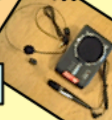
Monacor WAP+7D Digital Voice Amplifier

React2- React2 is a new suite of software which can be used with Stroke patients. It is an upgrade from the original React from Propeller Multimedia. The programme is all done online so there is no software to install. Therapists can set patients up at home or in another site and monitor their progress through the software. There are a number of modules which have all been rewritten. They include Auditory Processing, Visual Processing, Life Skills, Semantics and Memory and Sequencing. We understand that there is to be a pilot trial of React2 in Lothian very soon. For more information go to www.propeller.net/react2 .