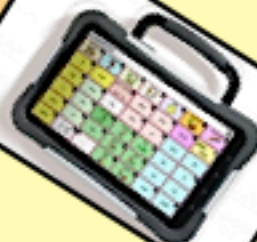
Nova Chat 7